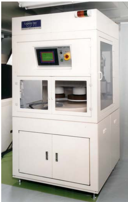
Model 712 System