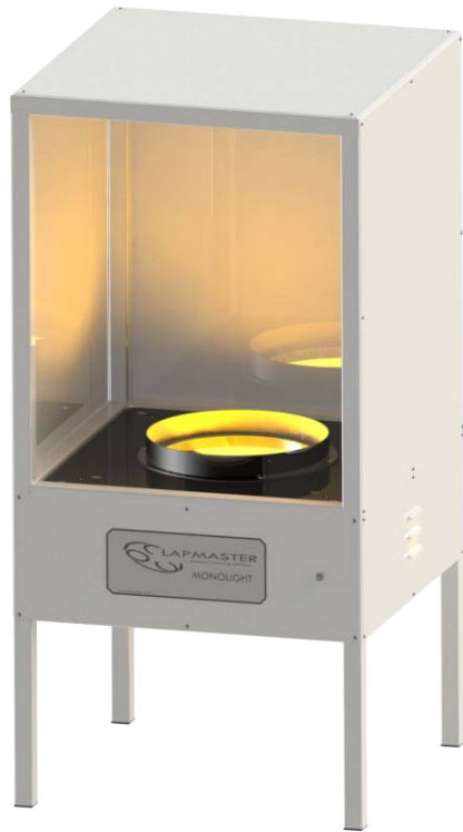
Floor Standing Monochromatic Light Unit